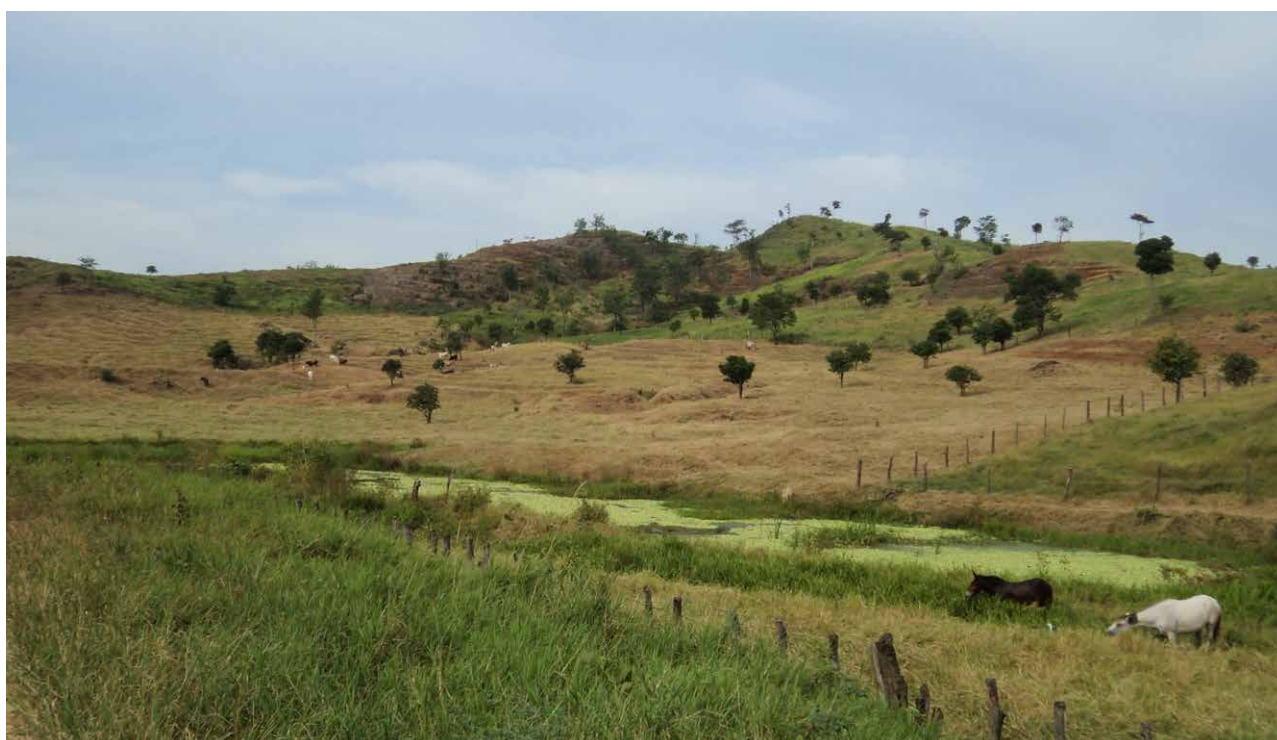
Photo 4. Reinvesting in degraded lands combining grey and green solutions in Venezuela