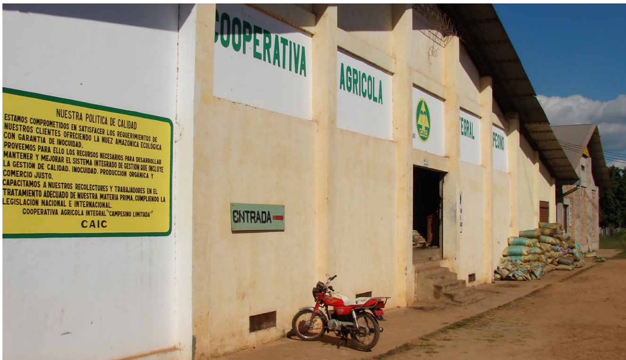
Photo 5. Cooperative brazil nut processor in Riberalta, Bolivia