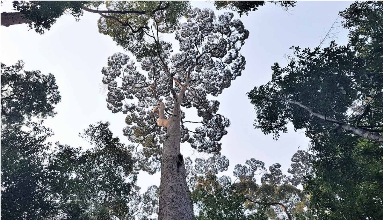
Photo 9. Managing forests for both local and international environmental services in Desa Gema village forest, Indonesia