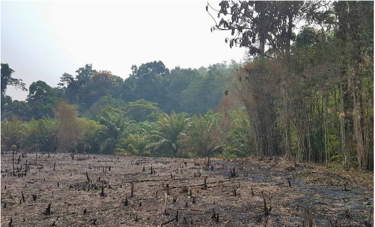
Photo 10. Independent oilpalm production in a mosaic of food cropping and secondary and primary forest in Indonesia