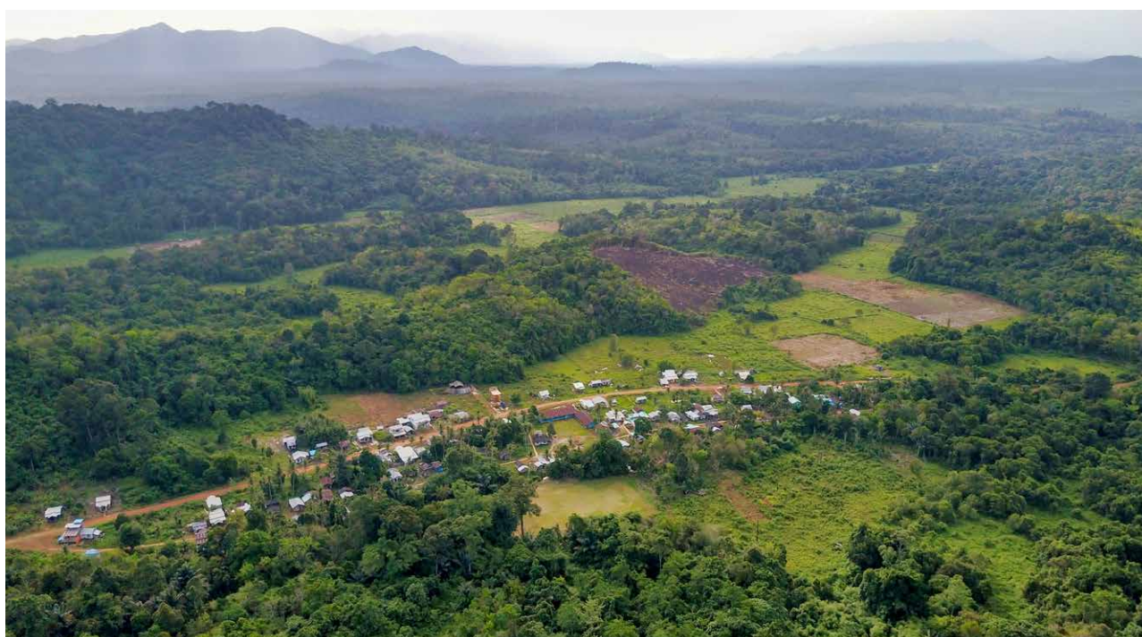
Photo 16. Aerial view of Cali hamlet in Gunung Tarak protection forest, Ketapang, West Kalimantan, Indonesia