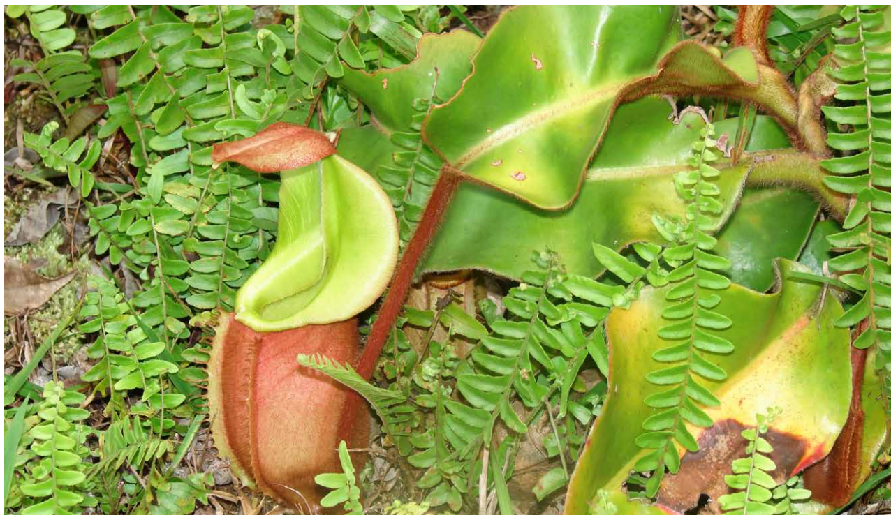
Photo 13. Well managed local tourism can combine biodiversity benefits with knowledge generation (scientific tourism) and local income