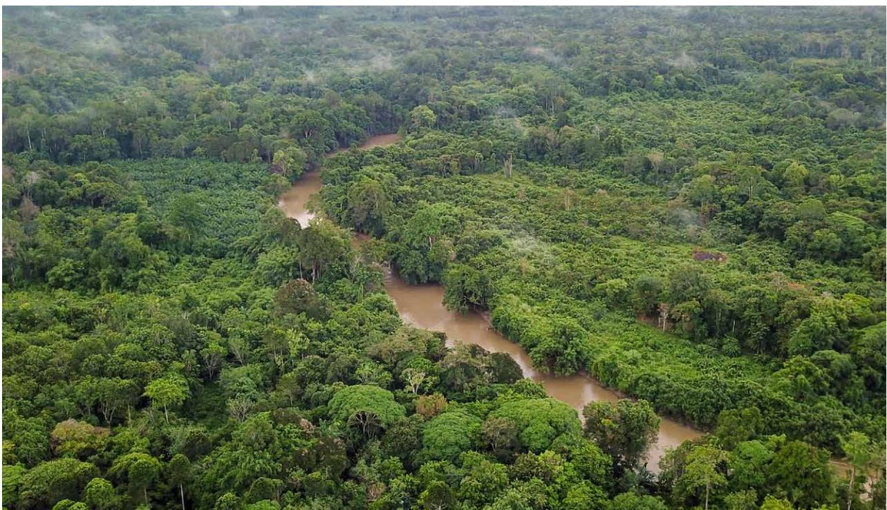
Photo 11. Forested areas in Balai Berkuak, West Kalimantan, Indonesia