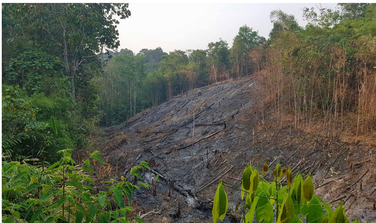
Photo 2. Shifting cultivation in Indonesia