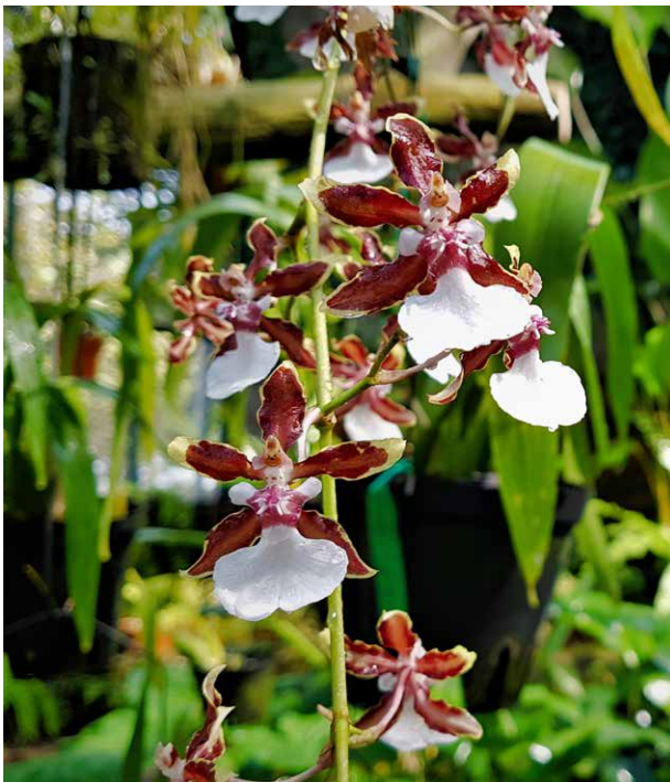
Photo 14. Rowing orchids outside the forest is a specialist job but may generate interesting business opportunities if well regulated