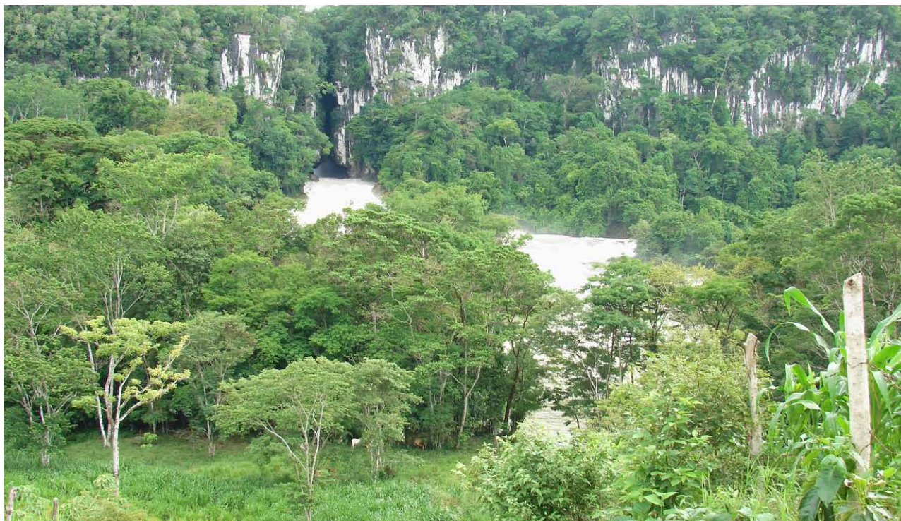
Photo 6. Tourism opportunities in Chiapas Mexico