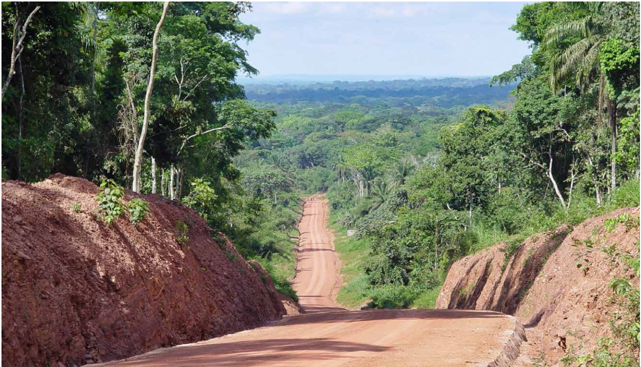
Photo 1. Opening up new landscapes in DRC