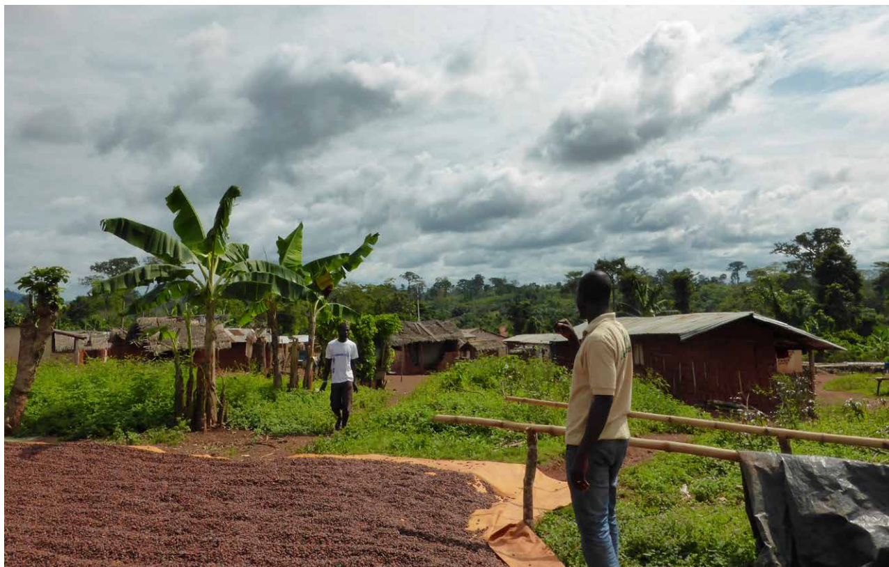
Photo 15. Cocoa beans drying in the sun, Juaboso, Ghana