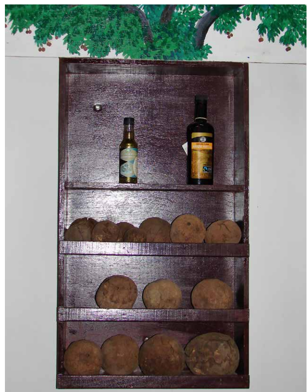
Photo 8. Marketable Brazil nut products Riberalta, Bolivia

Once the existence and appropriateness of the resource and market are confirmed, access entails physical aspects, human aspects (information, skills) and social aspects (legal and customary rights, equity). Physical access depends on infrastructure, means of transport, products sold or bought (quantity, individual size, perishability) and the need for storage. While road infrastructure is typically