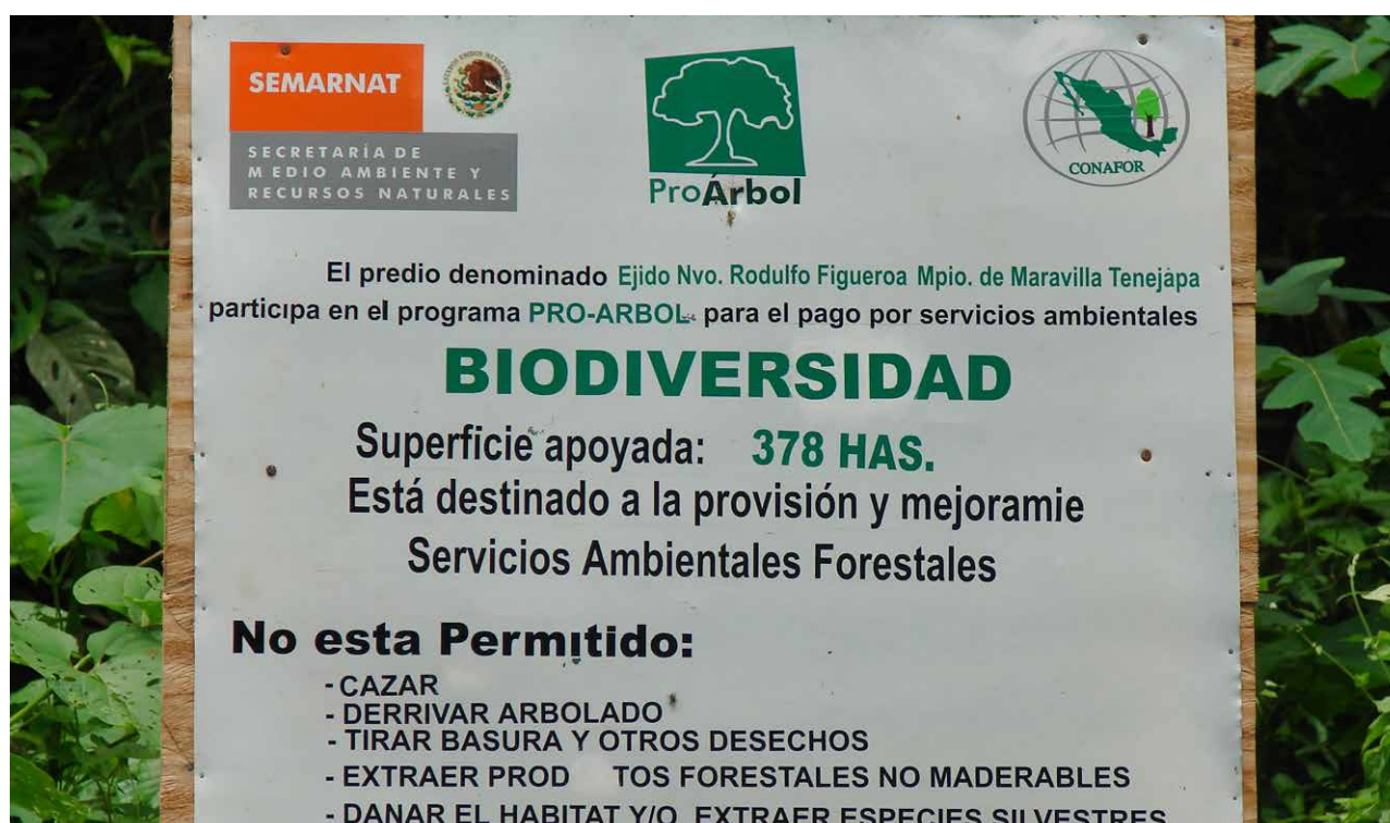
Photo 7. Payment for environmental services as a means to link national goals to local needs in Chiapas Mexico