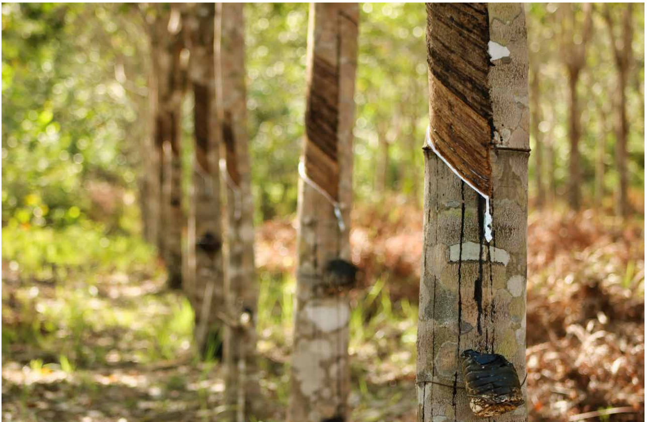
Photo 12. Community's rubber plantation in Laman Satong Village, West Kalimantan, Indonesia

The SLI approach is the basis of New Forests' proposal to improve the measurement and monitoring of its impacts on social and environmental issues (New Forests 2018a). Monitoring is performed over time and is meant to show that the management approach improves performance and is supported by appropriate risk management and governance. It is New Forests' policy to present the results of monitoring at the fund level, rather than at individual investment level. It can be expected that the explicit inclusion of conservation areas, as in the case of HKI in Kalimantan, will have positive impacts on the natural environment, while the planting and restoration of natural areas will contribute to the global carbon balance and create employment opportunities. Thus, it can be expected that New Forests' investments that follow the SLI principles will contribute to SDGs 8 (Decent work and economic growth), 12 (Responsible production and consumption), 13 (Climate action) and 15 (Life on land). In addition, all investments follow the IFC Performance Standard, which requires investors to ensure inclusiveness, both in general and particularly for women and vulnerable groups, thus contributing to SDGs 5 (Gender quality) and 10 (Reduced inequalities) as well.