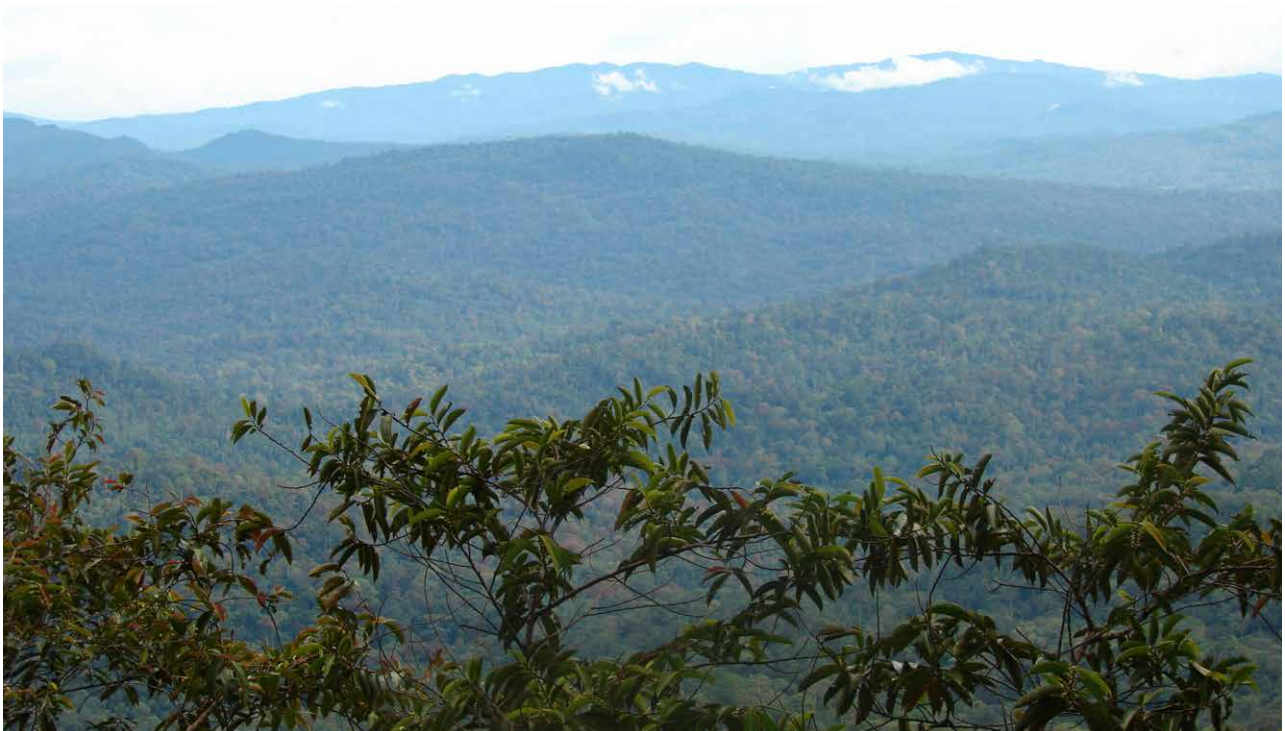
Photo 3. Forest landscape in Sabah