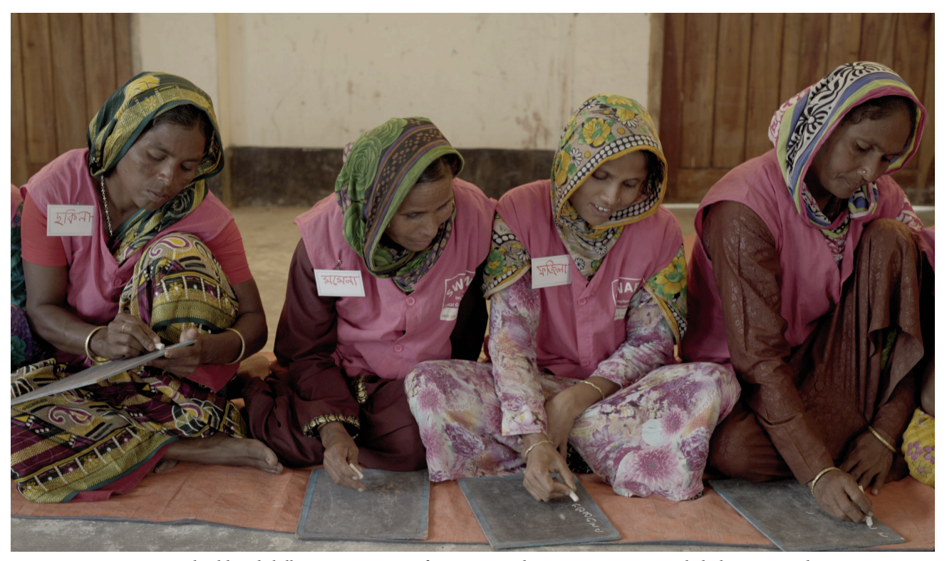
Women participating in a livelihood skills training as part of an SDG Fund joint program in Bangladesh.

This program underscores the positive connections between women's inclusion, poverty reduction, and peaceful societies. It also highlights the power of SMEs to promote inclusive growth. By facilitating public-private partnerships with these enterprises (SDG 17), it is generating job opportunities that empower women, build the resilience of households, and increase economic inclusion (SDGs 5 and 8), which ultimately makes the community more inclusive and peaceful (SDG 16).