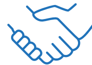
Transaction Advisory Services