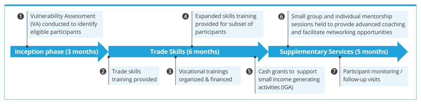
Figure 1: Timeline of livelihoods programming supported by DIB at the time of the launch

The interventions are delivered through Siraj livelihood centres hosted by community-based organizations (CBOs). Siraj centres are physical hubs managed by CBOs, where vulnerable individuals can access training, financial resources, and advisory services to support their livelihoods or find referrals for other services. As a result of the COVID-19 pandemic, the programmatic approach was adjusted to expand its digital training offering while providing greater support to beneficiaries in business digitisation.