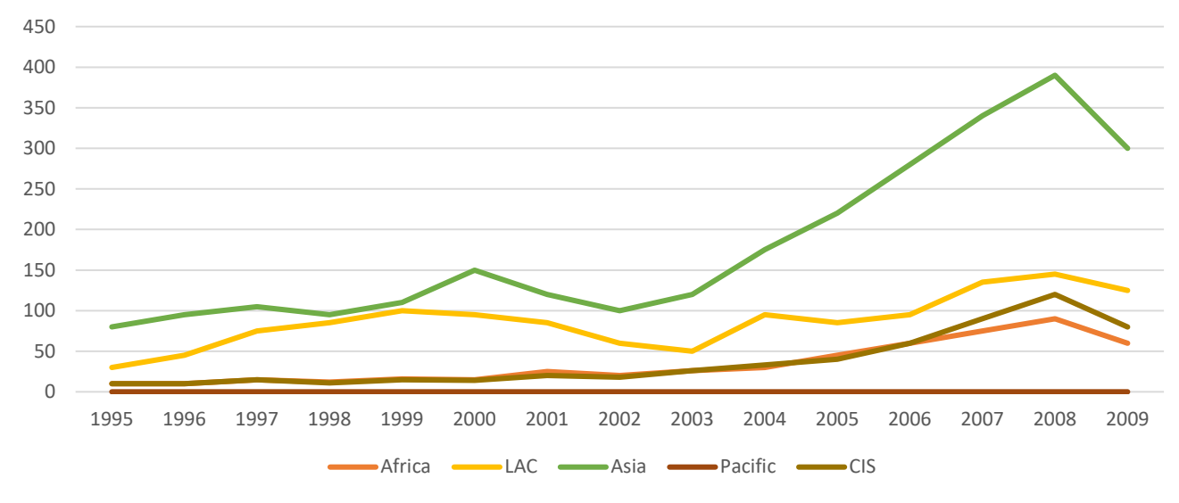
Figure 2: FDI Inflows, by Region (US$ billions)89